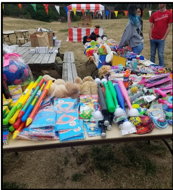
The prize table

Afterwards, the real fun began as we hosted the much-anticipated Carnival Day. We set up a handful of games and activities, such as bowling, corn hole, face/hair painting, and my favorite, a bouncy castle. Another company provided a free ice cream truck. A table overflowing with prizes – from Wells Fargo plush ponies to coloring books and a mountain of plastic toys – awaited the carnival-goers as they played for prize tickets to a booming soundtrack of kids music. Besides toys, the kids also all