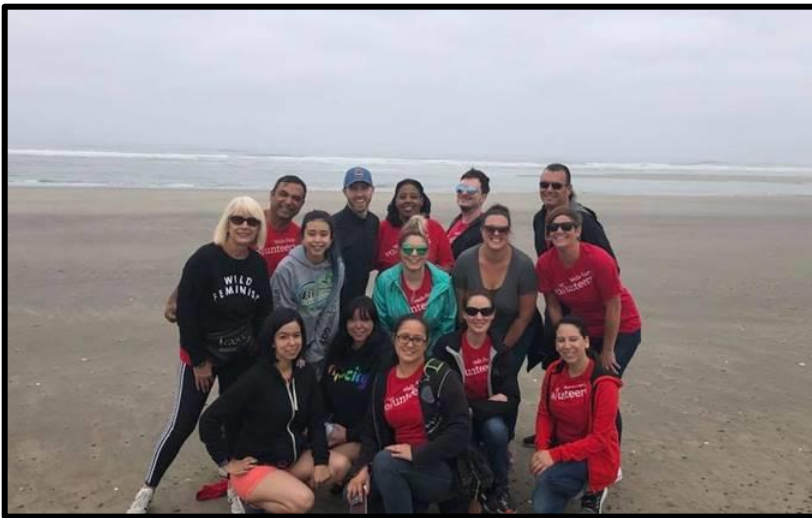
Board members volunteer at Camp KC